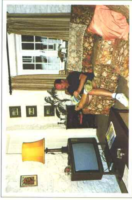
Relaxing in Shippen

Our cottages are all prepared to the same high standard and kitchens are equipped with most things that you will need, from microwave and toaster to garlic press and cafetière.