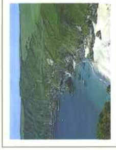
Lantic Bay between Polperro and Polruan